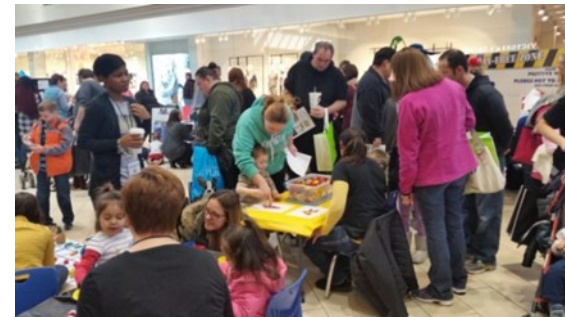
Families engage with early childhood educators at the math station

Eighteen Trumbull County school districts were present to meet incoming kindergarteners and answer families' questions about kindergarten readiness and registration.